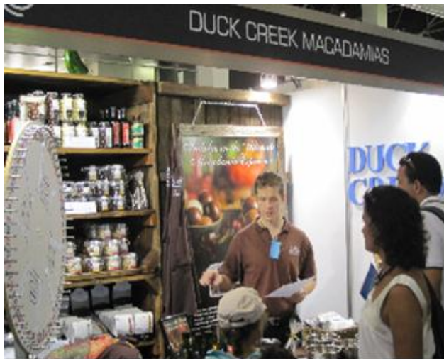
2010 Masterchef Live